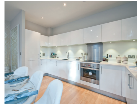
Interior image is from a previous development built to a similar specification.