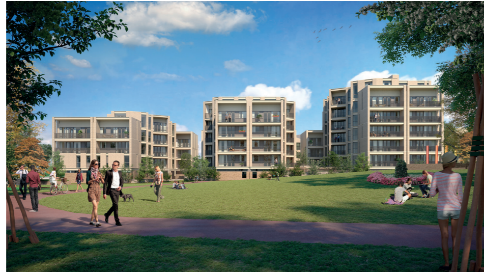
CGI of BASE17.