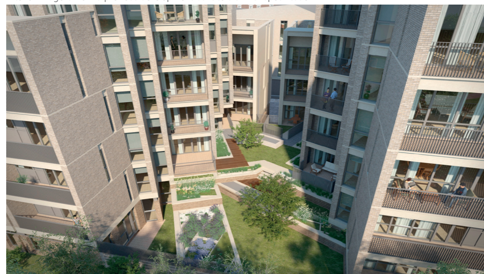
CGI of BASE17.

For more information about Land and New Homes in London, contact: